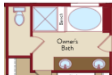
Opt. 5-piece Owner's Bath