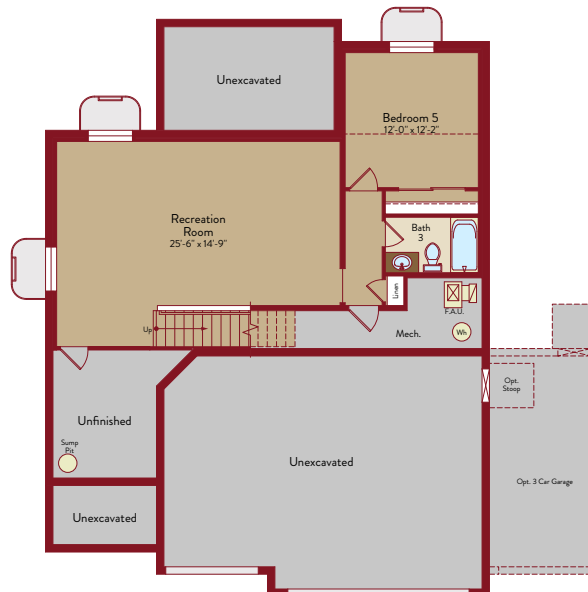
Opt. Finished Basement 759 Sq.ft.