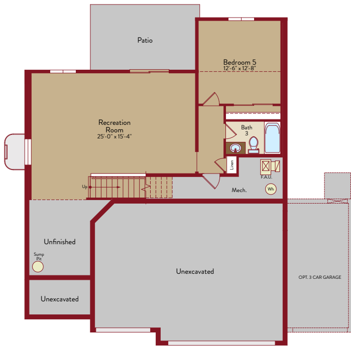
Opt. Walkout Basement 815 Sq.ft

Two Story | 2,358 SQ. FT. | 4 Bedrooms | 2.5 Baths | 3 Car Garage