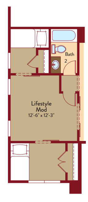
Opt. Lifestyle Mod