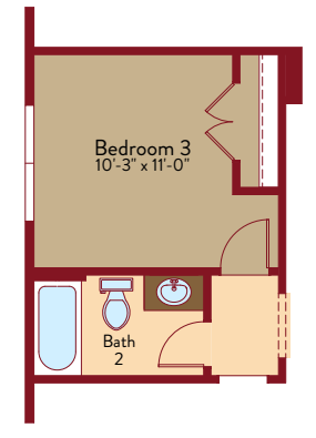
Opt. Bedroom 3