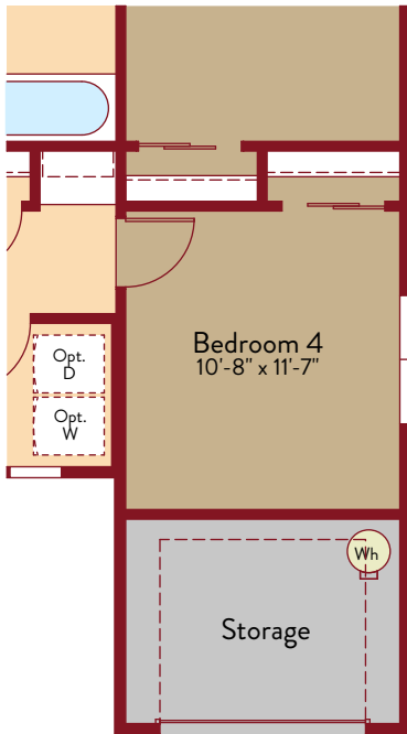
Opt. Bedroom 4/Storage

Single Story | 1,375 SQ. FT. | 3 Bed | 2 Bath | 1 Car Garage