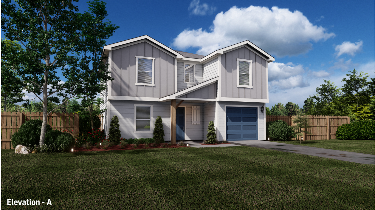
Elevation - A