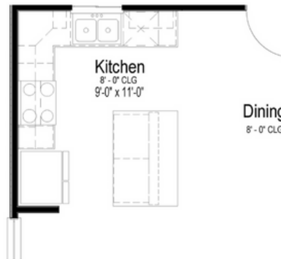
OPT. GOURMET KITCHEN