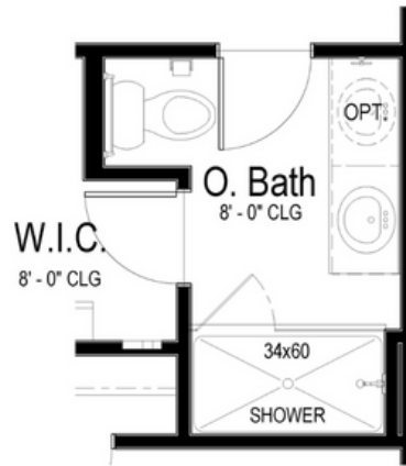
OPT. OWNER'S BATH W/ SHOWER