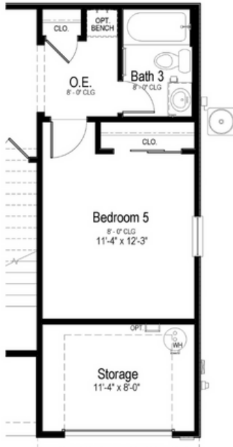
OPT. BDRM 5 / STORAGE

Two Story | 1,488 SQ. FT. | 4-5 Bed | 2.5 Bath | 1 Car Garage