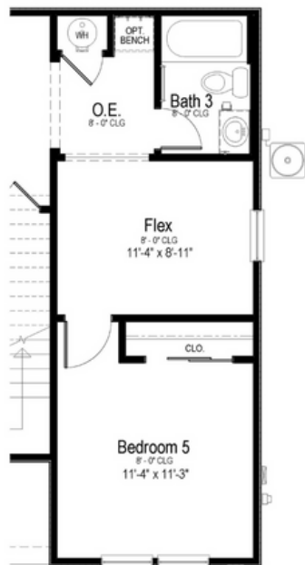
OPT. FLEX / BDRM 5