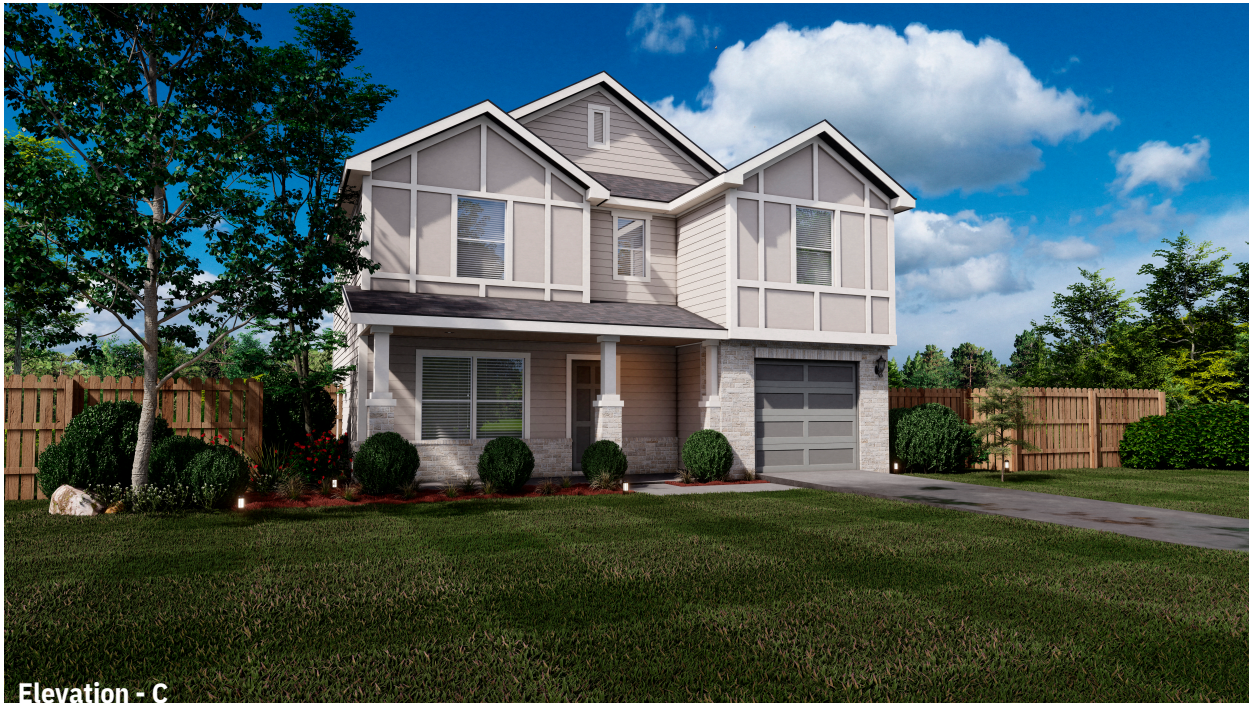
Elevation - C