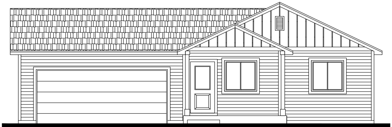
CRAFTSMAN ELEVATION - OPT 2 CAR GARAGE

Single Story | 927-1854 SQ. FT. | 2-3 Bedrooms | 1-2 Baths | 1-2 Car Garage