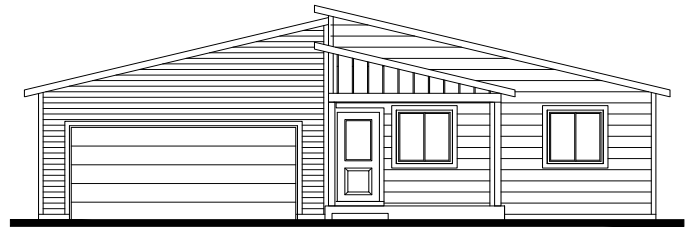
MODERN ELEVATION - OPT 2 CAR GARAGE